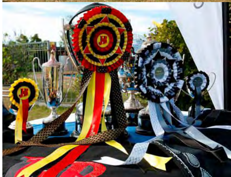
ABOVE: The showing committee outshone even themselves with the bling on offer to prize winners.